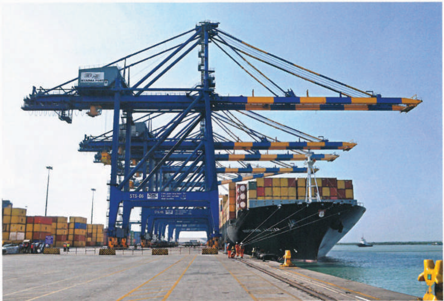
Mundra Port is India's largest private port and handled 52 million tonnes of cargo in 2010.

pithy reading is that the country's young population will continue to drive a consumption-led economy that will ultimately benefit companies such as his.